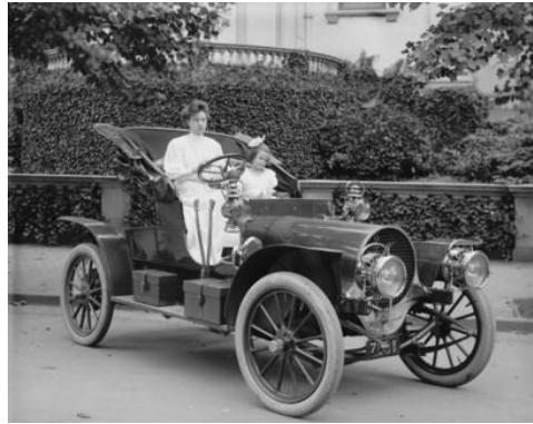
Figure 1: 1907 Franklin Model D roadster. Photograph by Harris & Ewing, Inc. [Public domain], via Wikimedia Commons. ( https://goo.gl/VLCRBB )